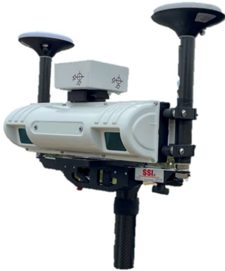
▲ CSL-90 Portable Scanning System ▲