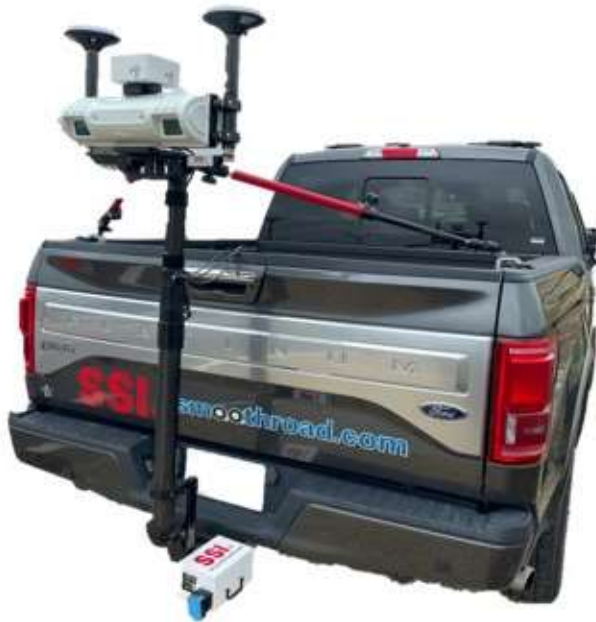
▲ CSL-90 with Inertial Profiler ▲